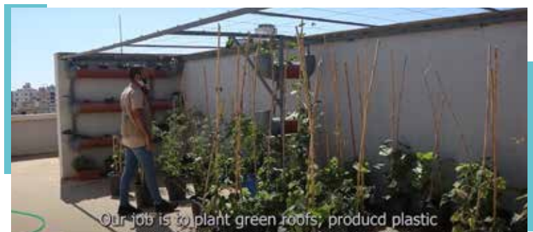
Click on the image to watch the video:

In collaboration with COSPE, URDA’s WEE.CAN project managed to support 3 different businesses owned by women. These businesses received a grant that helped them to develop their work, purchase new equipment and guaranteed them sustainability. #MSMEs and #SMEs support to reach income generation is one of the most important goals of our livelihood Sector.